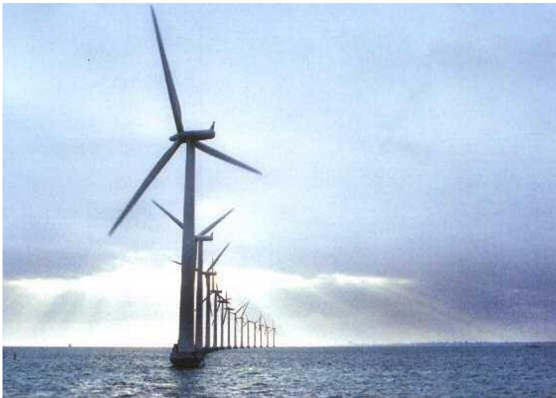
Offshore park Middelgrunden, Denmark, 20 2MW Turbines