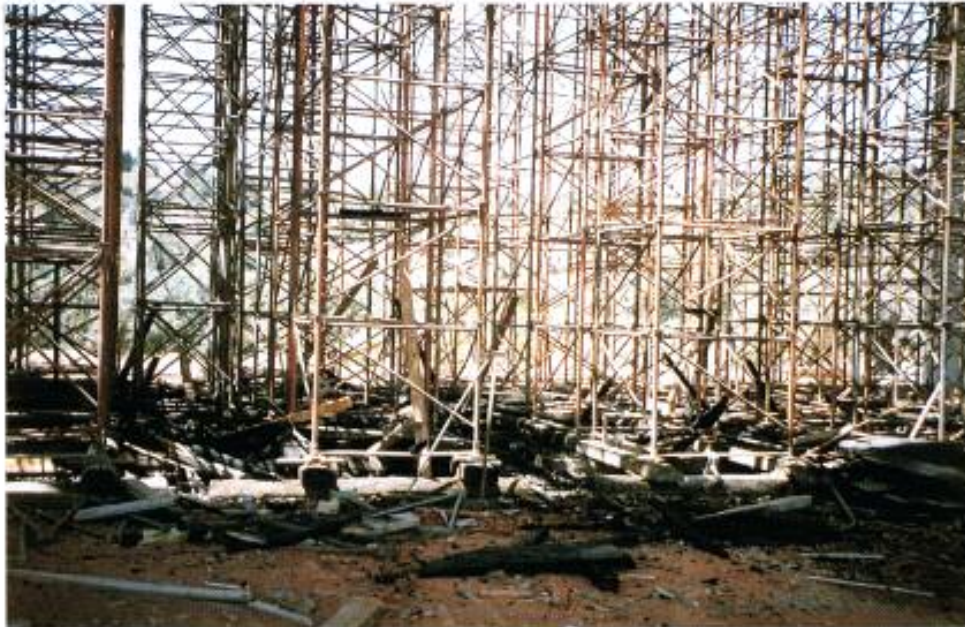
Burning falling debris caused gutting of wooden sleepers