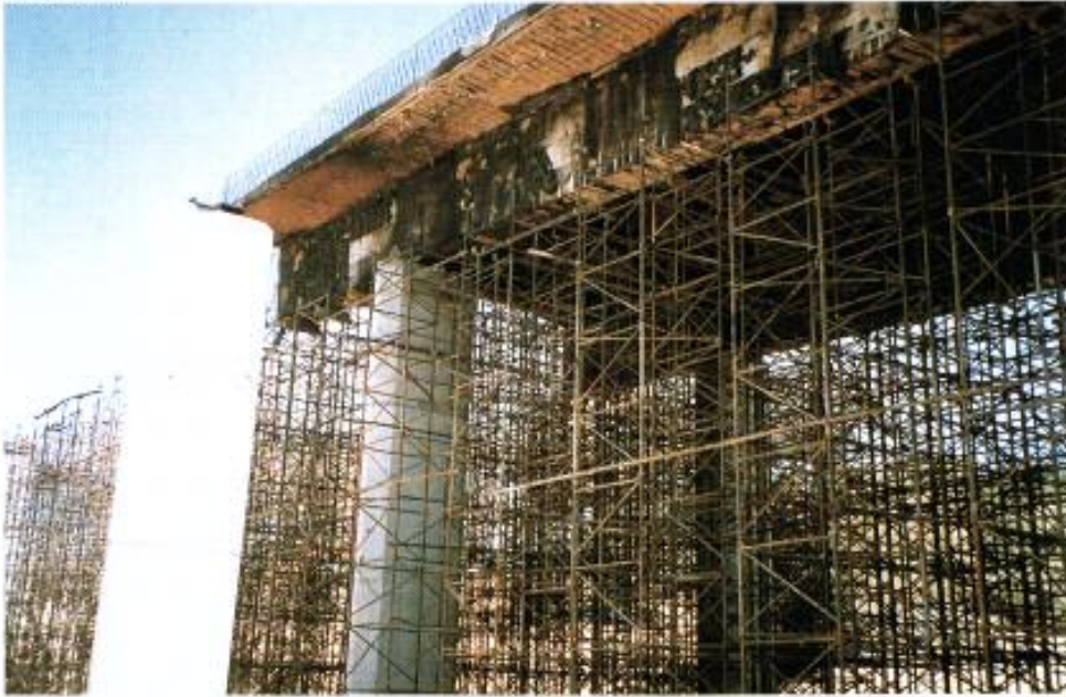
Heat caused expansion of armouring and spalling of concrete