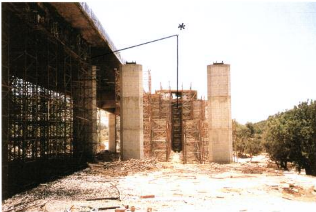
Twin bridge under construction (* two sources of fire)