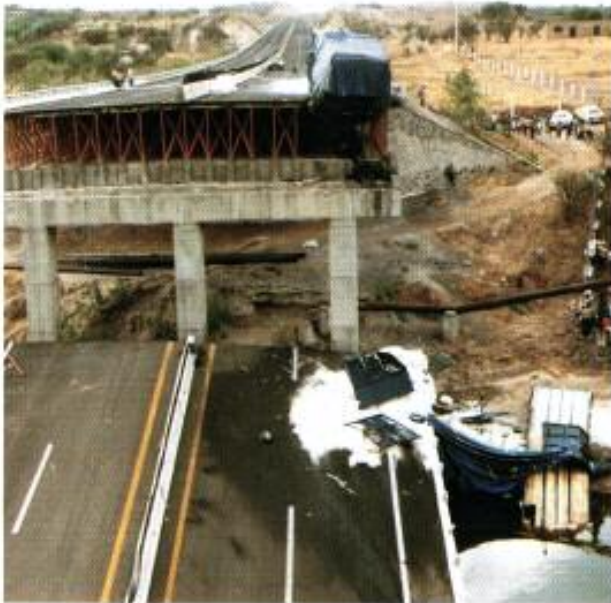
Slide No. 118 Collapsed bridge as part of highway