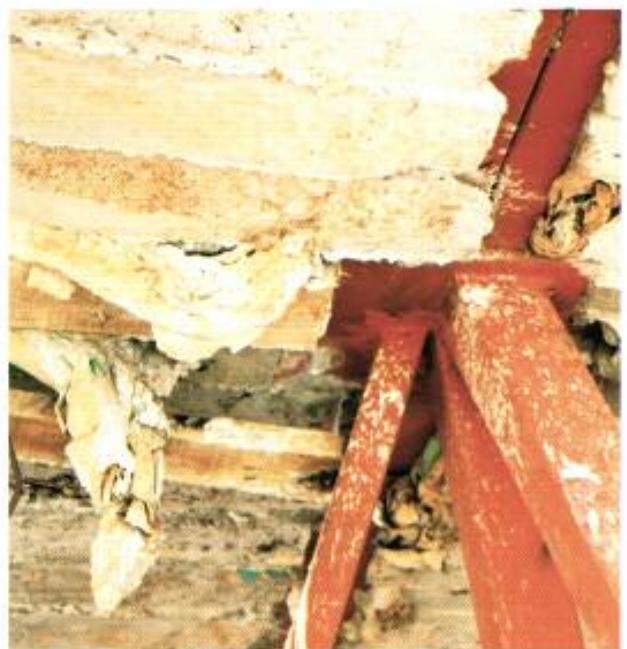
Slide No.121 Bad workmanship on concrete deck pouring