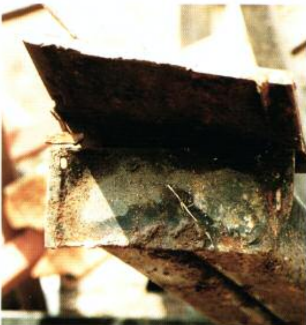
Slide No. 120 One of the welds which failed by simply coming loose