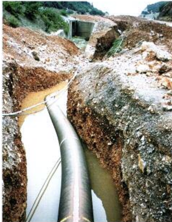
Slide No. 207 Eroded and collapsed trench slopes