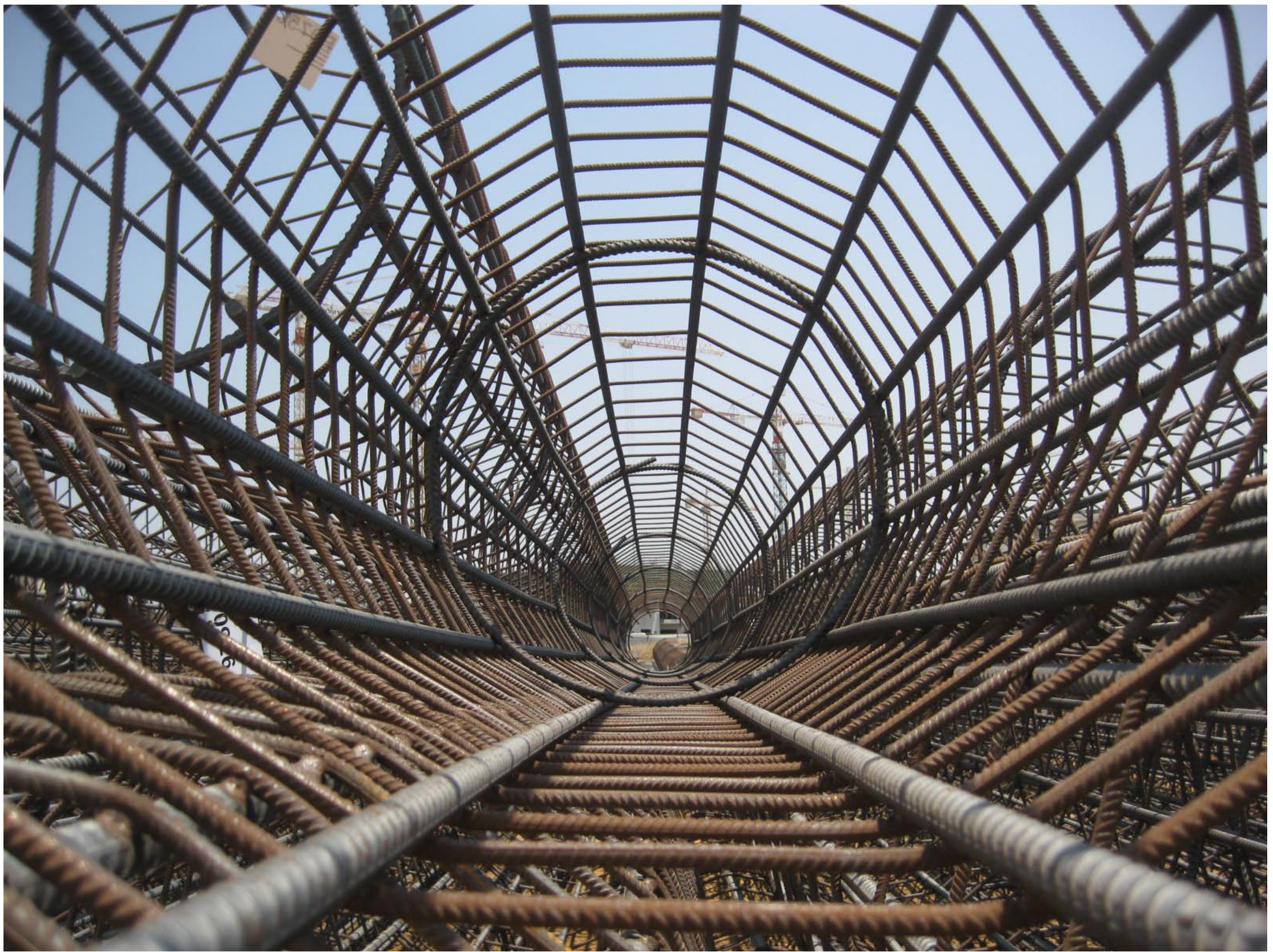
Steel reinforcement for pile foundation (Alon Eisenberg)