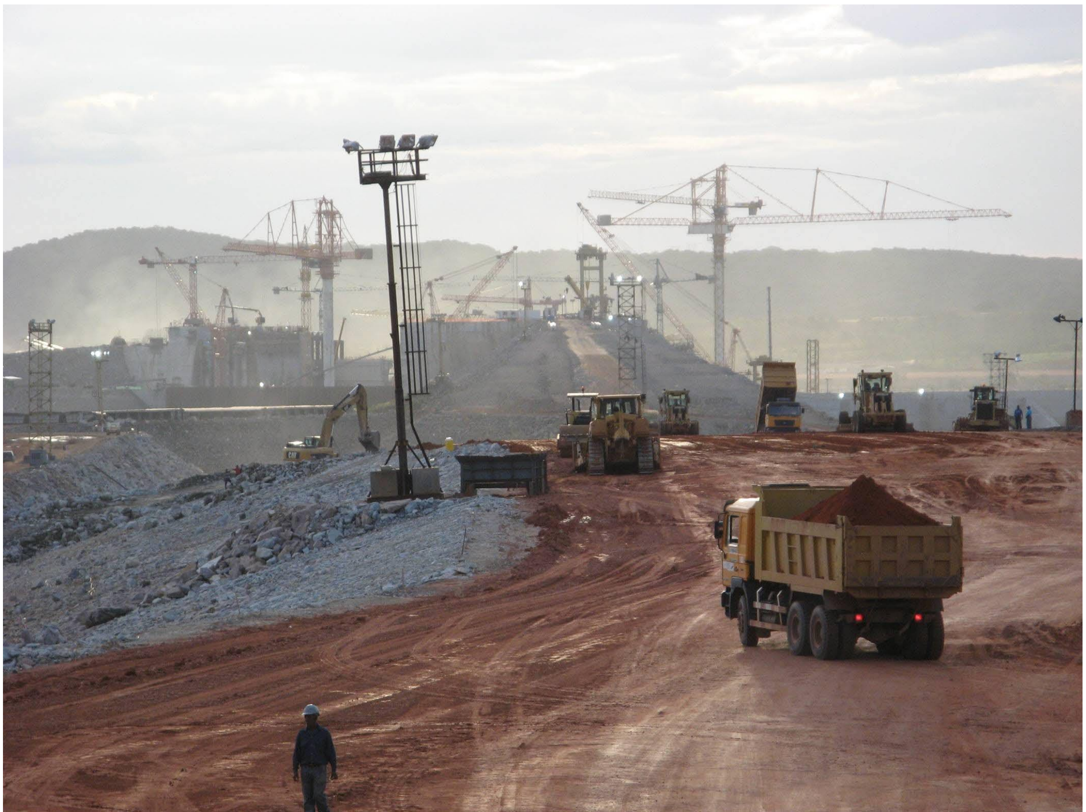
A busy day at Tocoma hydroelectric power plant, Venezuela