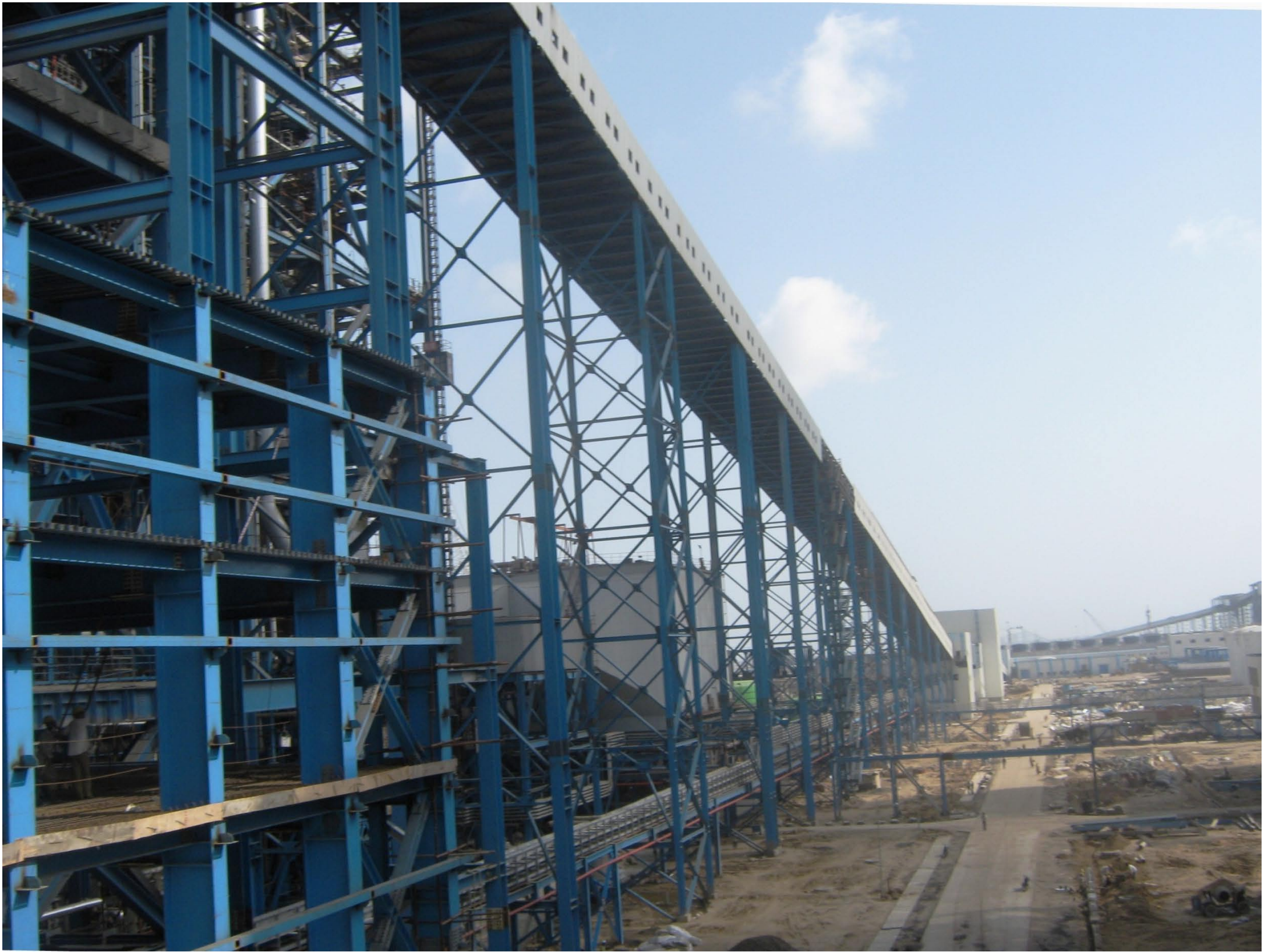
Coal conveyor during construction works (Hari Radhakrishnan)