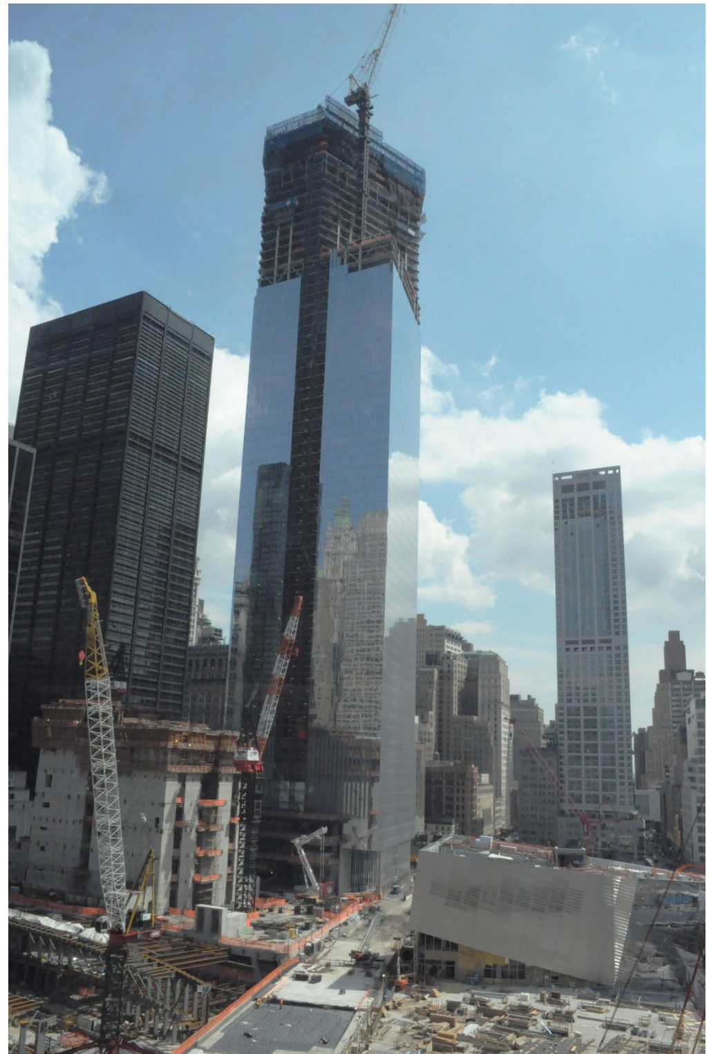
World Trade Centre - Construction site June 2012