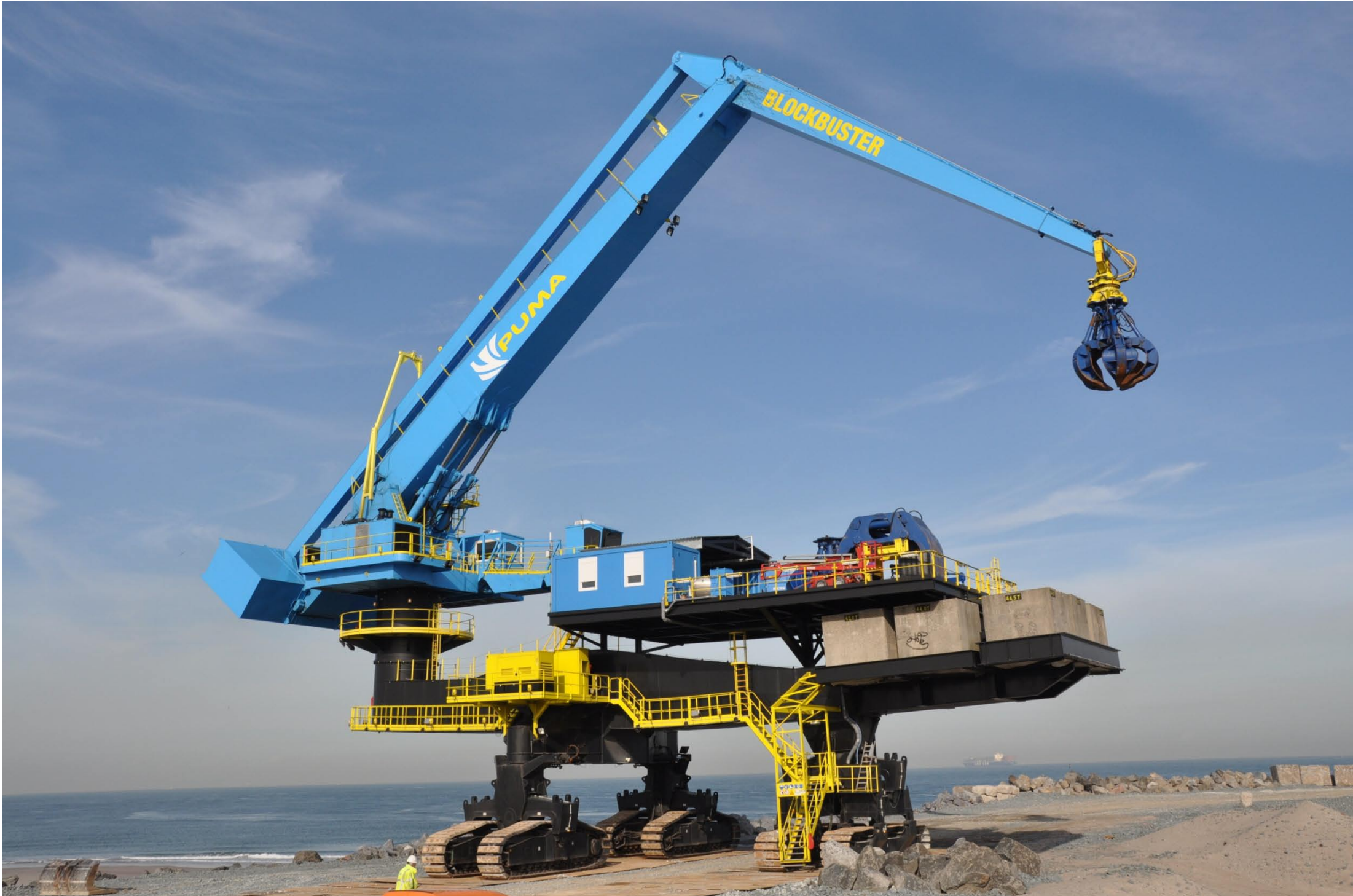
Machinery at PUMA harbour construction site, the Netherlands (Max Benz)