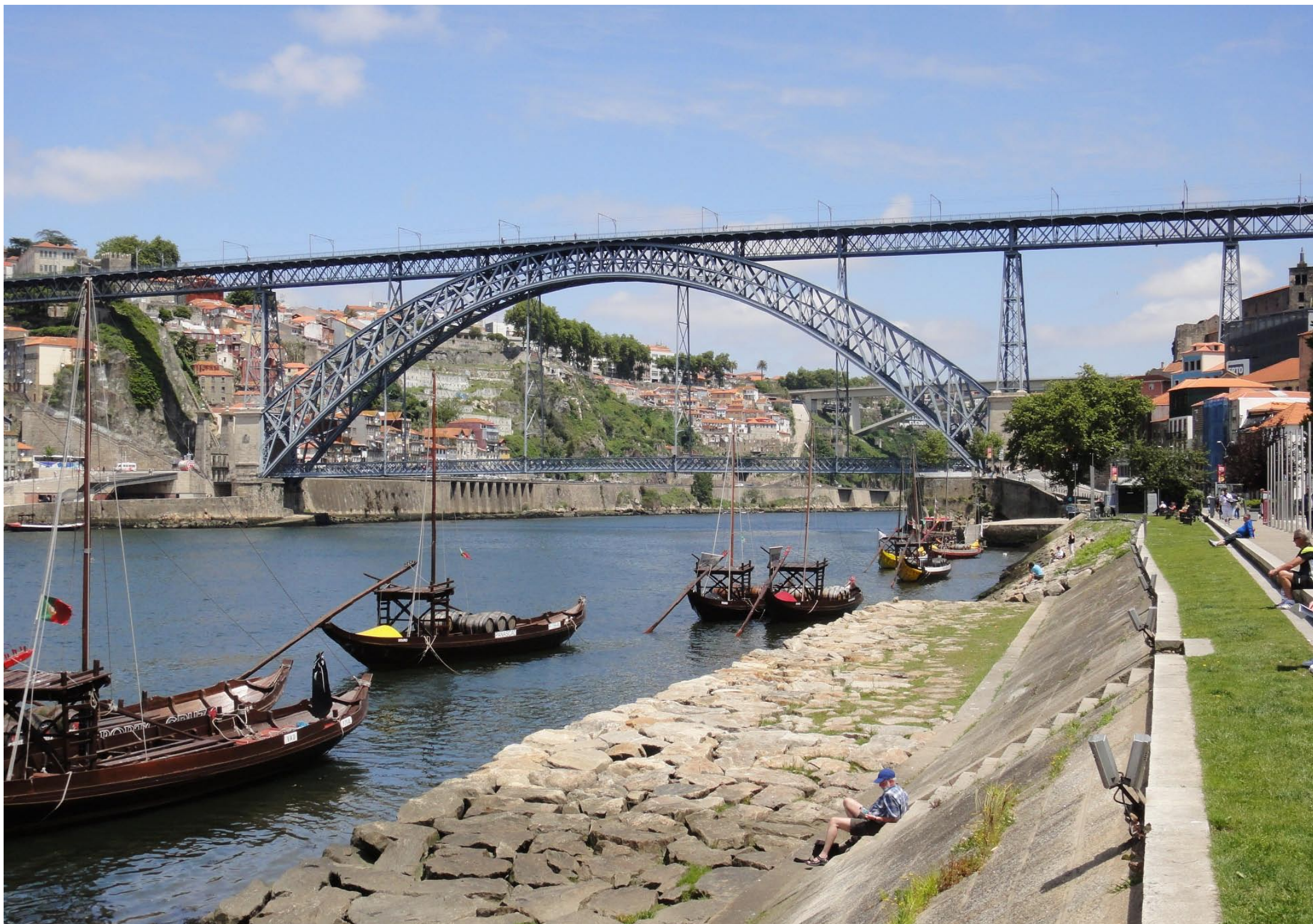
Bridge built by Gustave Eiffel in Porto (Utz Groetschel)