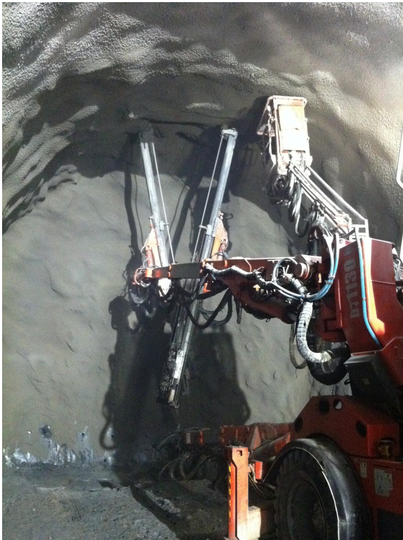
Drilling rig whilst drilling holes for the insertion of anchors into the tunnel arch (Kurt Eichenberger)