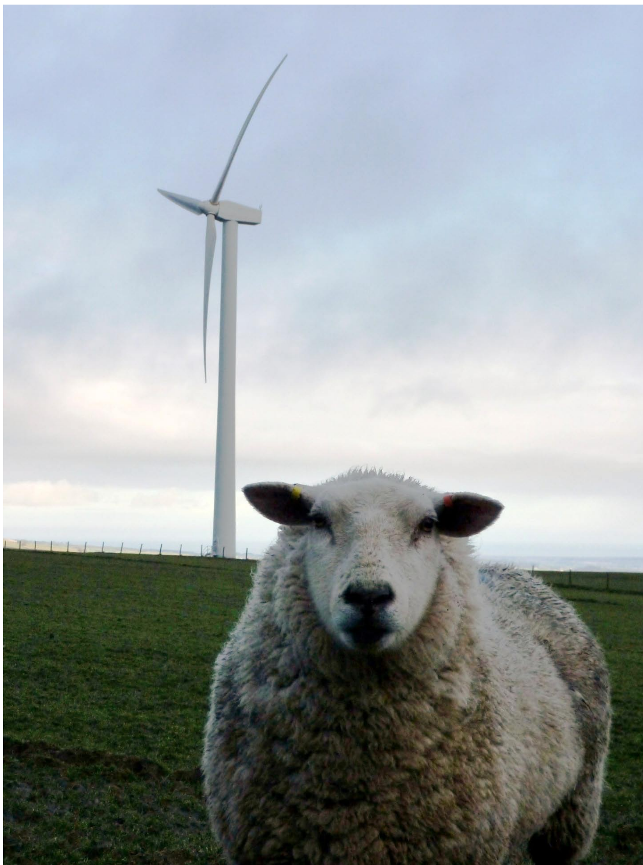
Wind turbine on a shepherd's farm (Christoph Hoch)