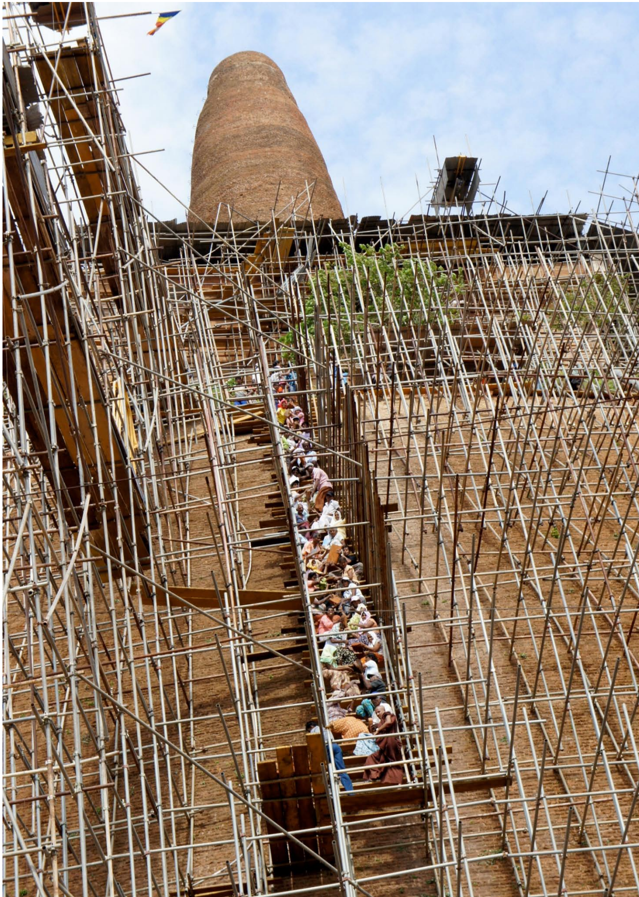
Hoisting material in Sri Lanka