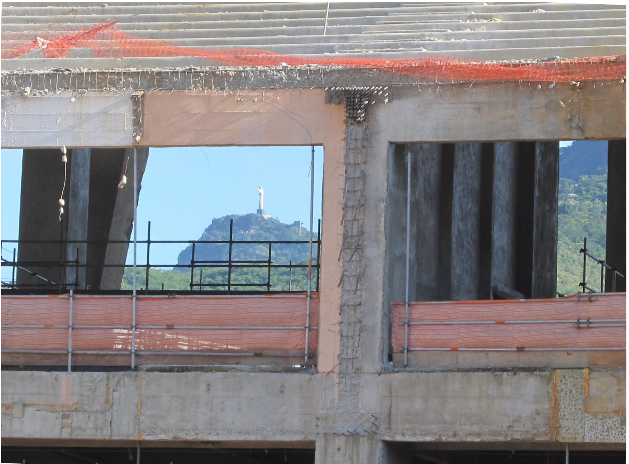
Construction works at Maracana Stadium with Rio's landmark in the background (Fabio Silva)