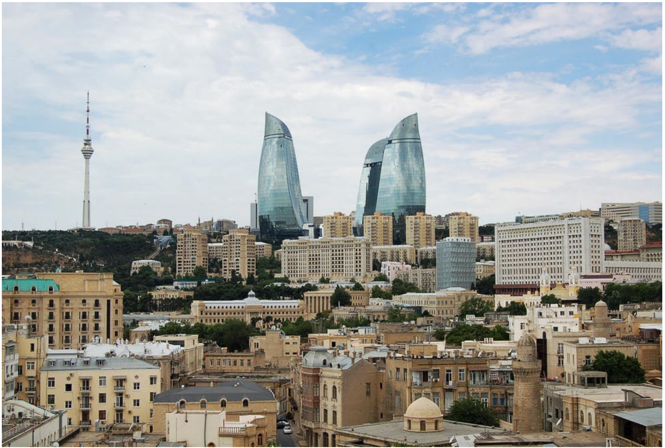
Baku - Flame Towers (Farid Hidayatov)