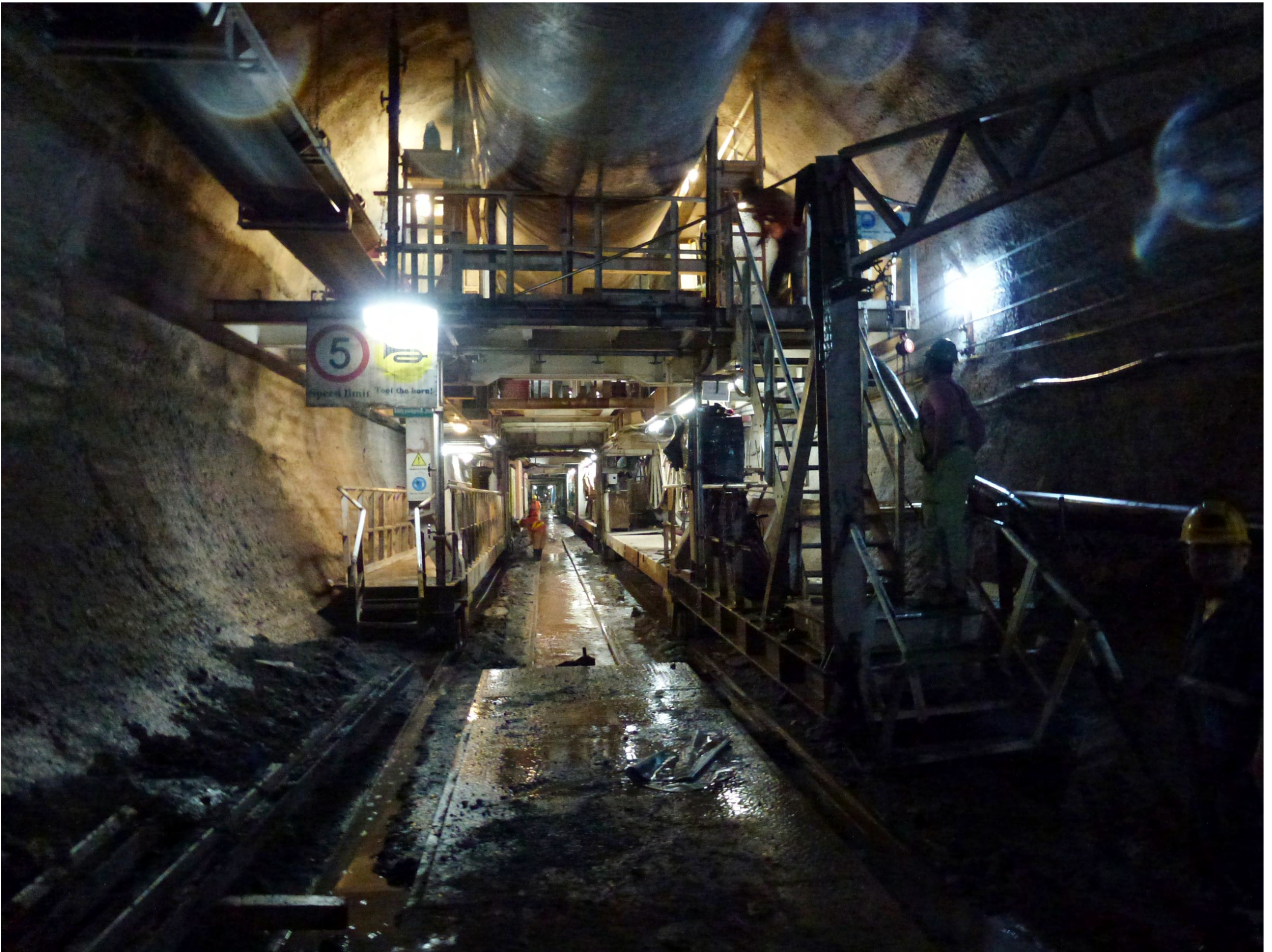
Tunnel boring machine