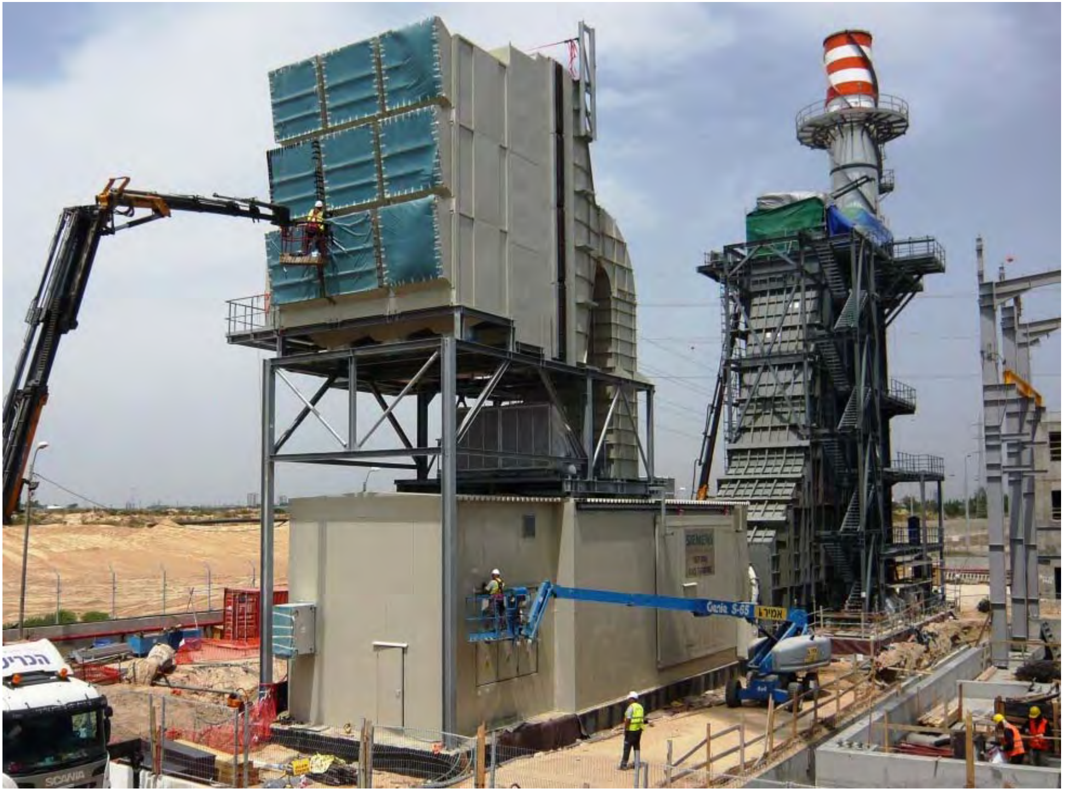
Combined Cycle GT Power Plant Project – by Alon Eisenberg, Engineers Surveyors &. L/A's