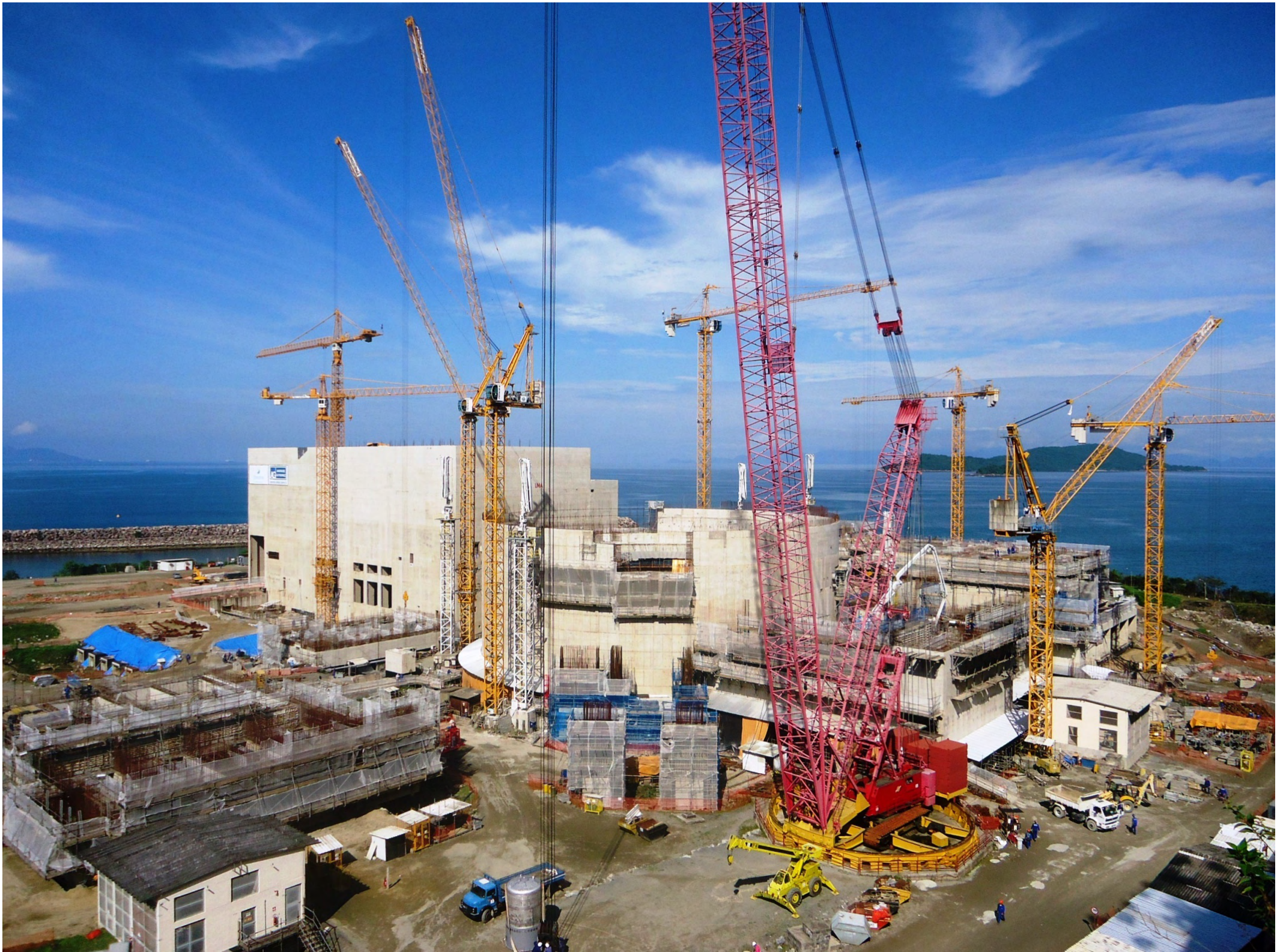
Civil Works Nuclear Power Plant Angra 3 Brazil