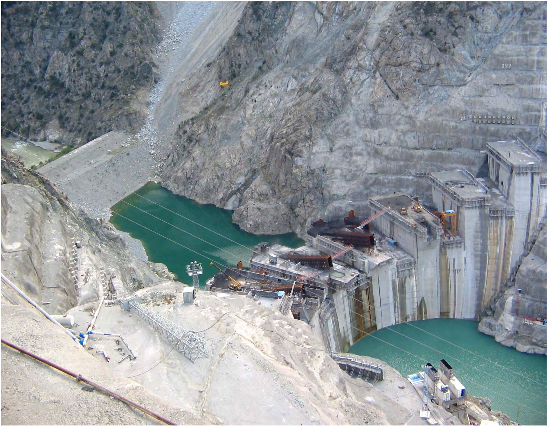
Deriner Dam at Artvin, Turkey