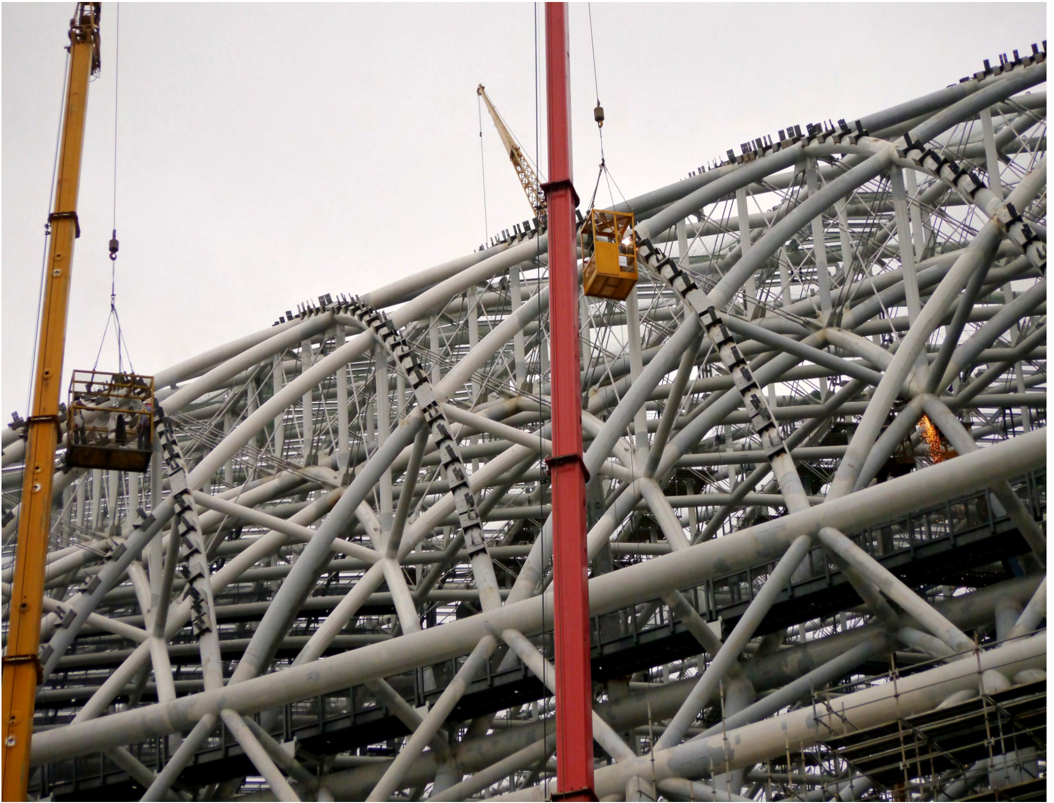
Taipeh New Area Construction