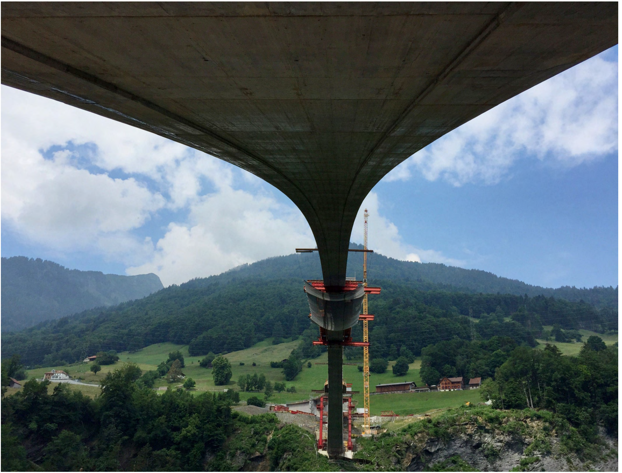
Tamina Bridge Switzerland