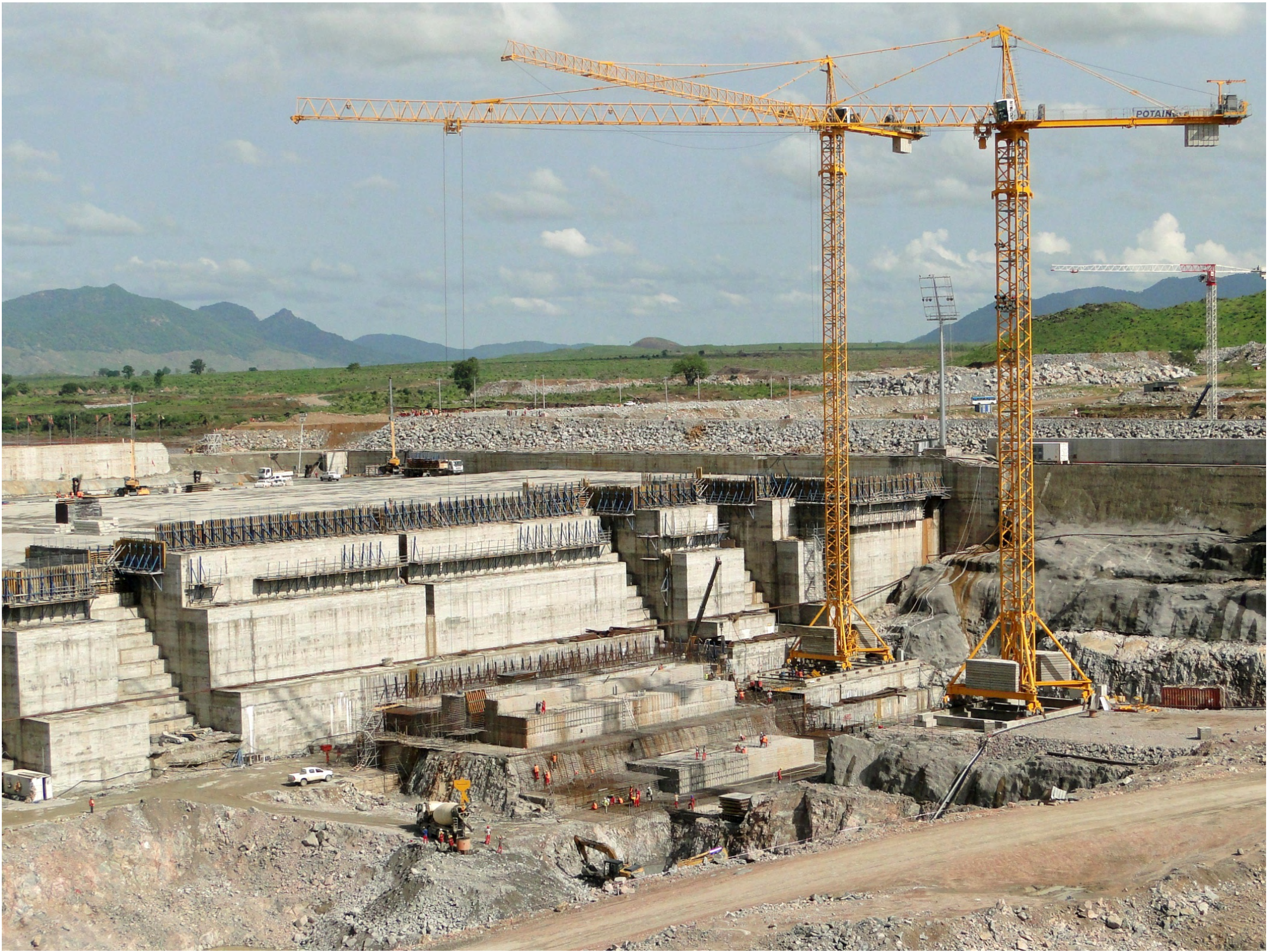
Renaissance Dam - Blue Nil, Ethiopia