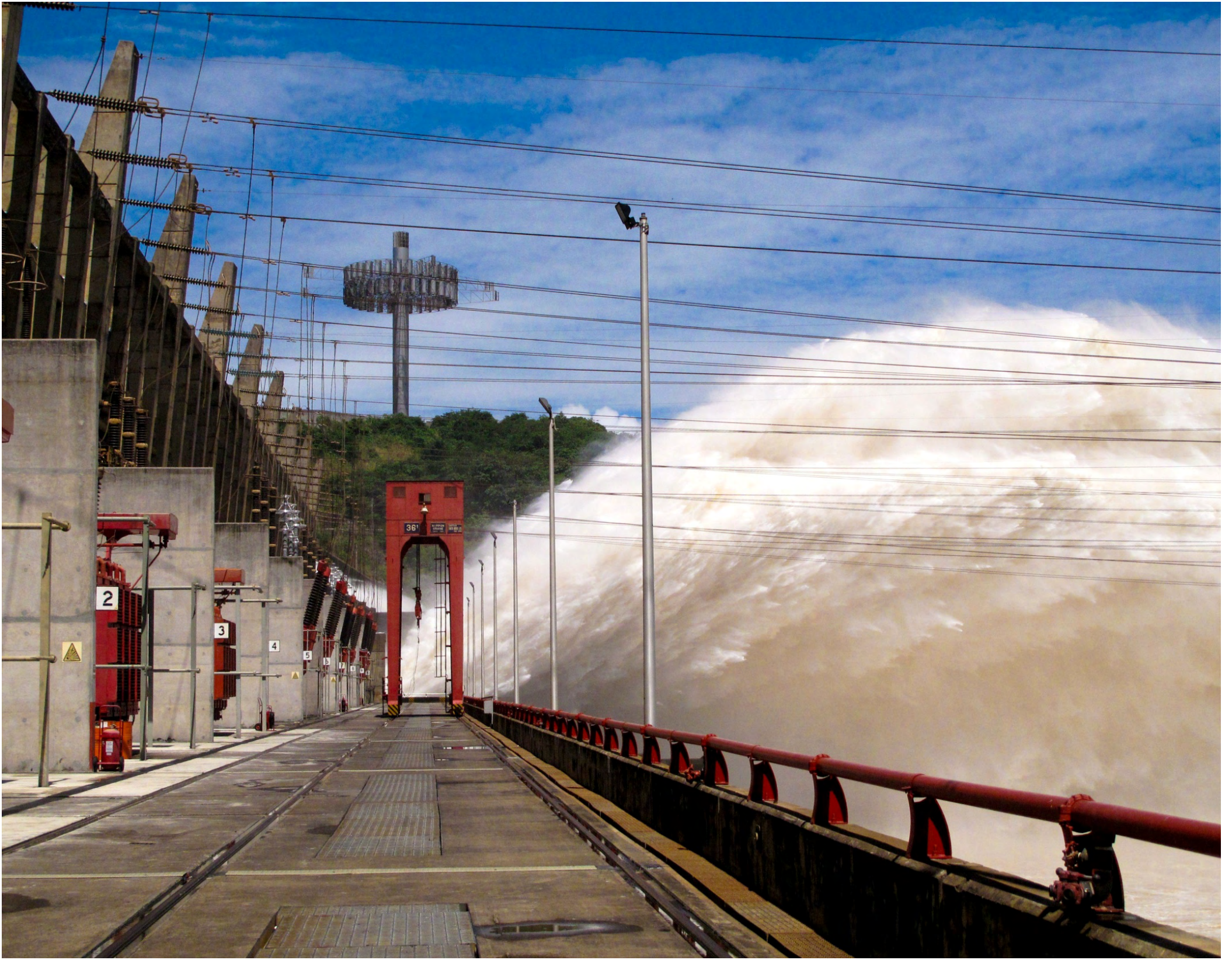
Discharging at Guri hydroelectric plant, Venezuela