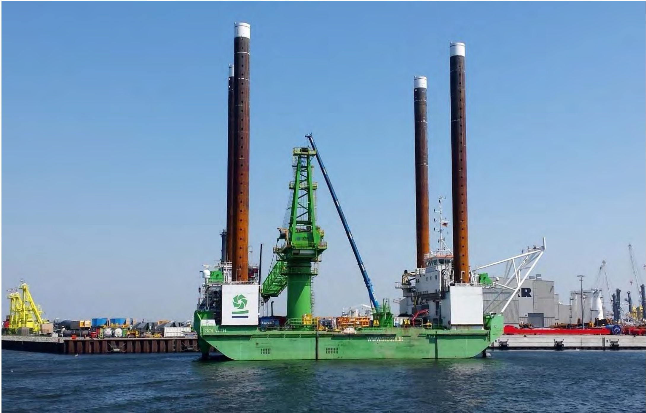
Mono-Piles for Offshore-Wind at Rostock - by Oliver Stein