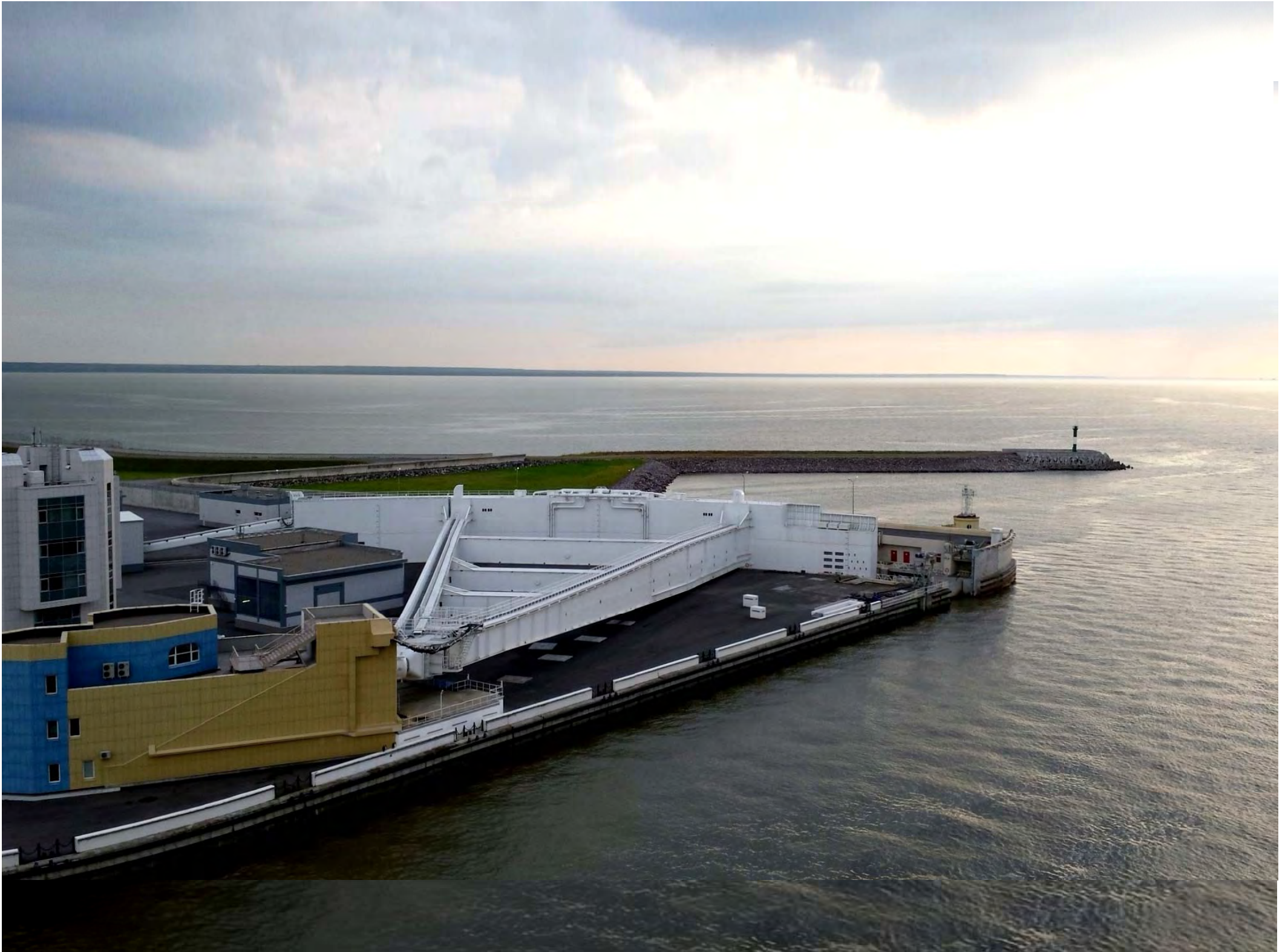
Flood gates at Kronstadt near St. Petersburg, by Oliver Stein, Gen Re (2015)