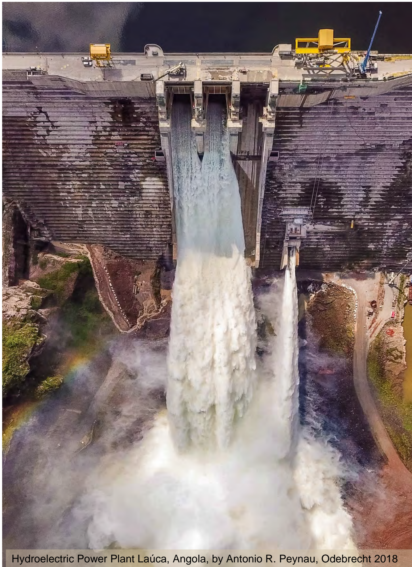
Hydroelectric Power Plant Laúca, Angola