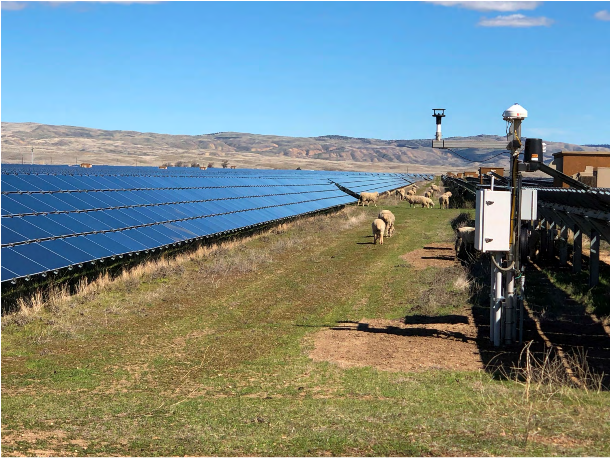
Sheep reducing fire hazard