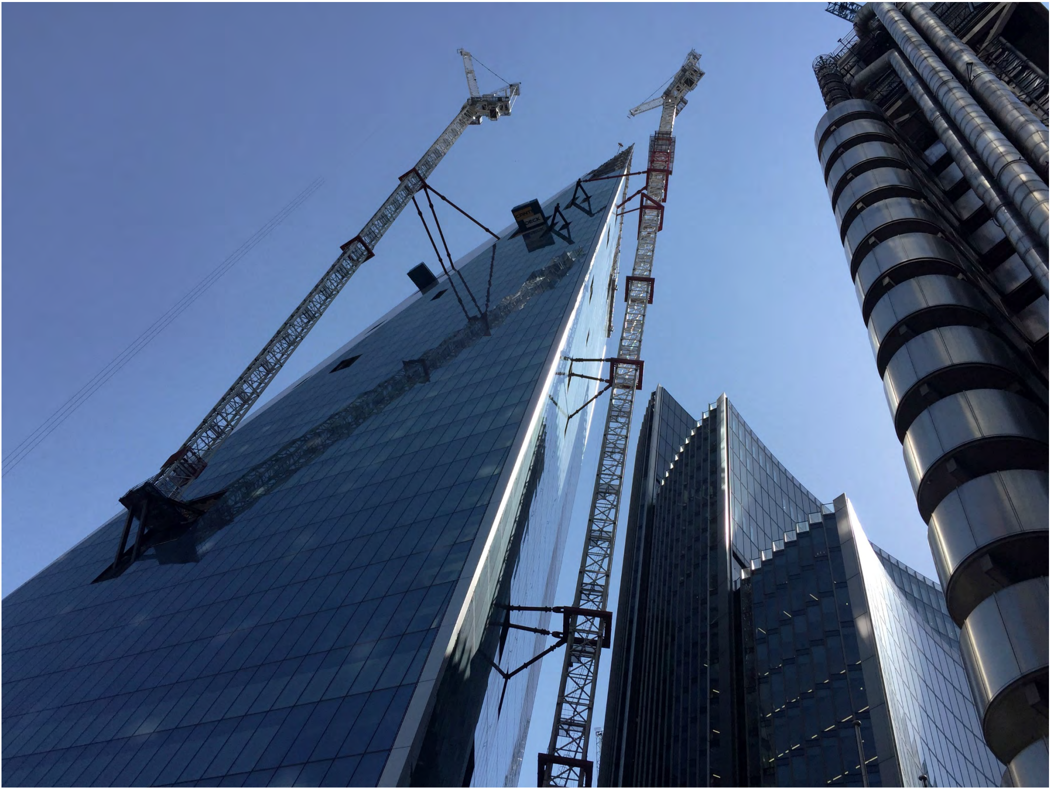
City of London – by Christian Müller, XL Catlin (2018)