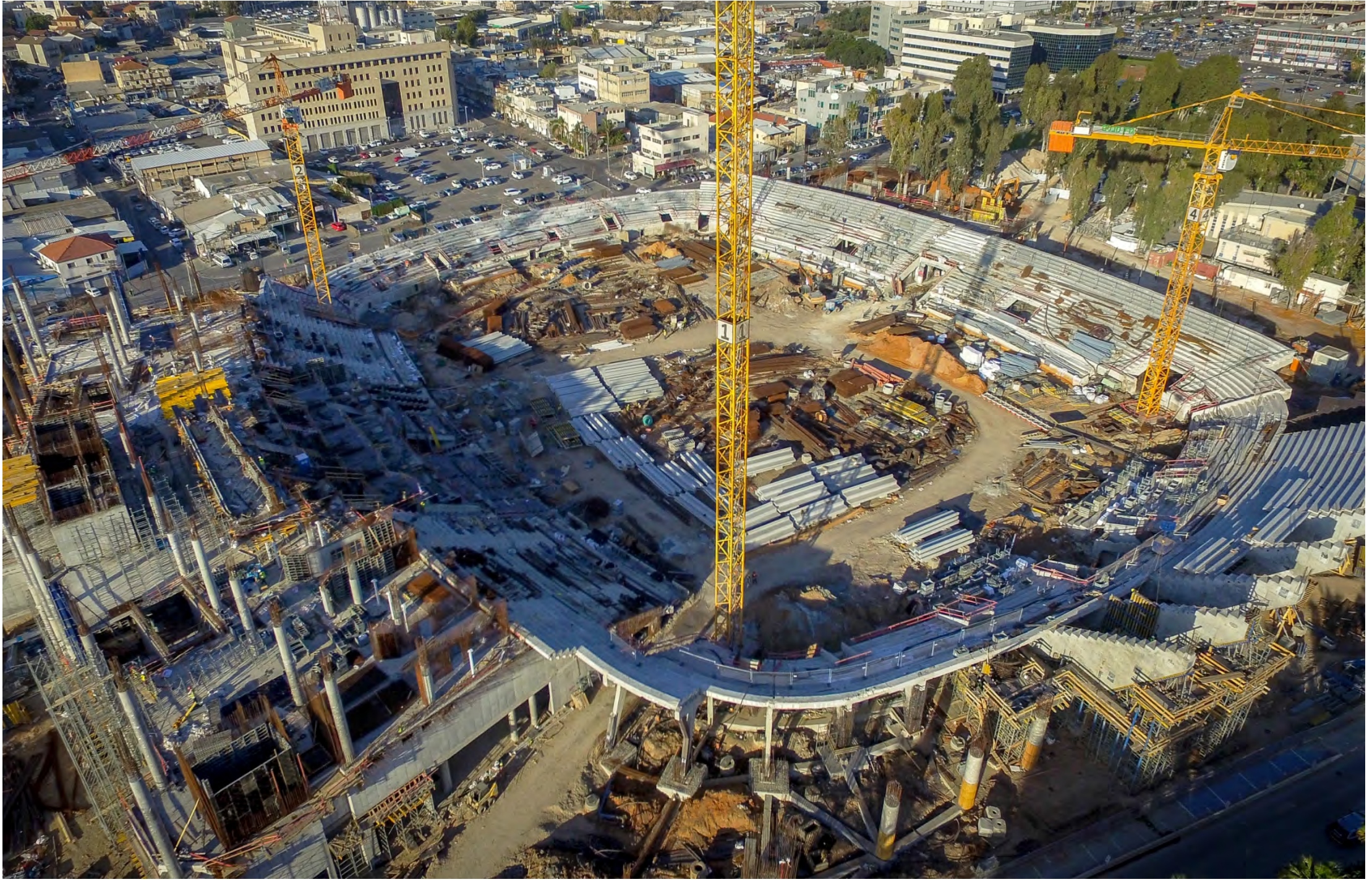
Stadium in Tel Aviv - by Alon Eisenberg, Israel (2018)