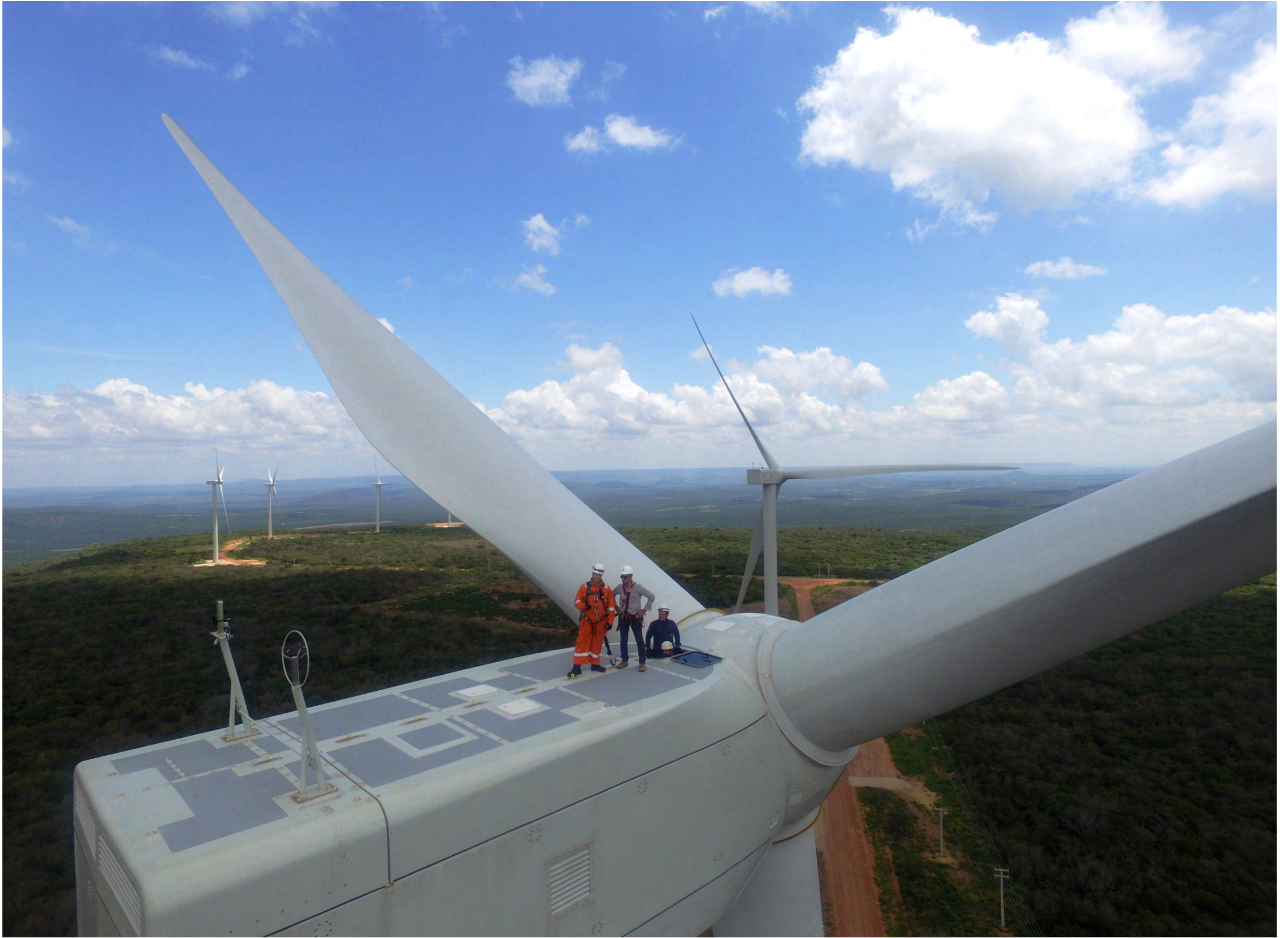
Wind Farm in Brazil