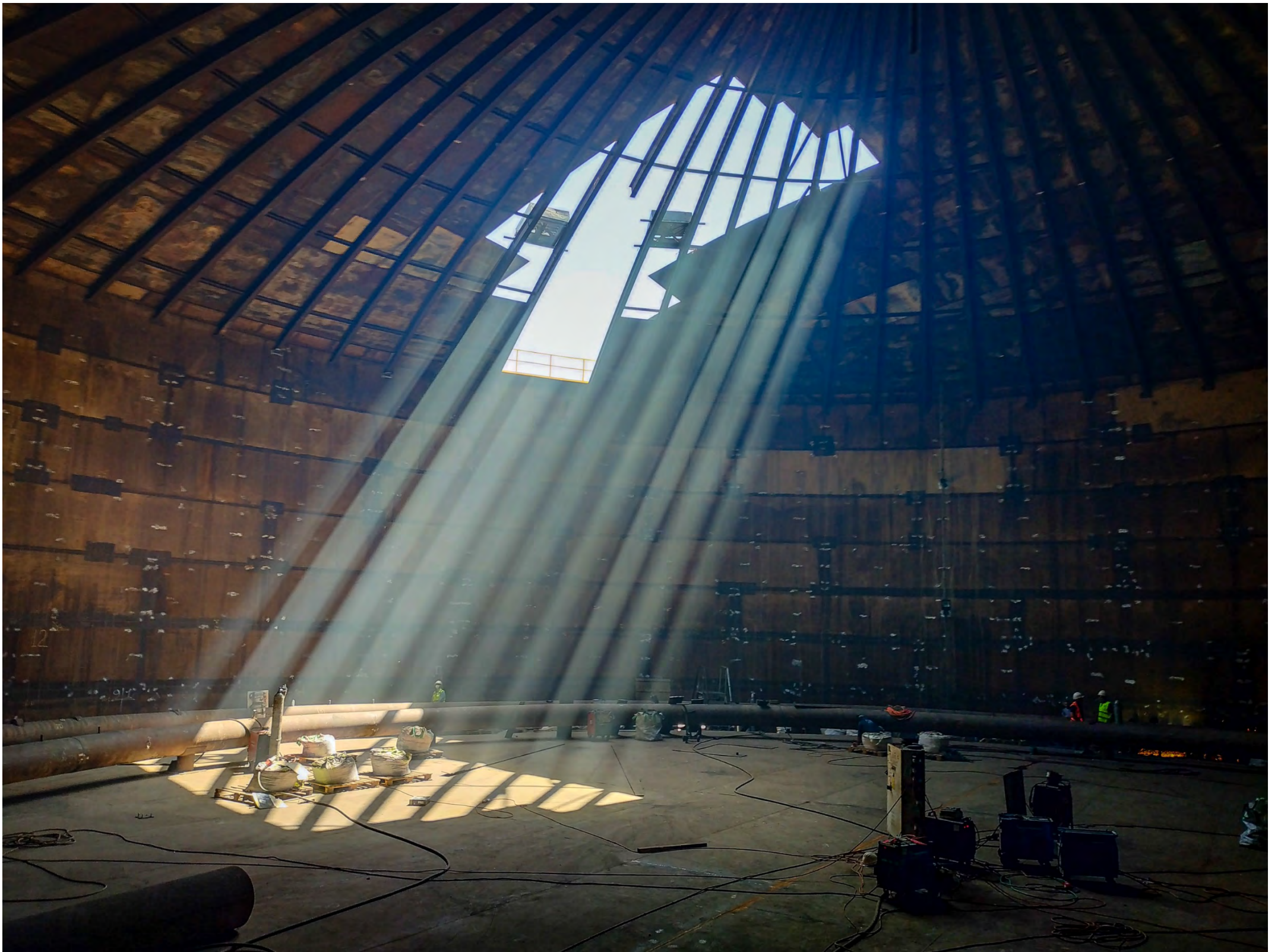
Ashalim Salt Tank – by Alon Eisenberg, Israel (2018)