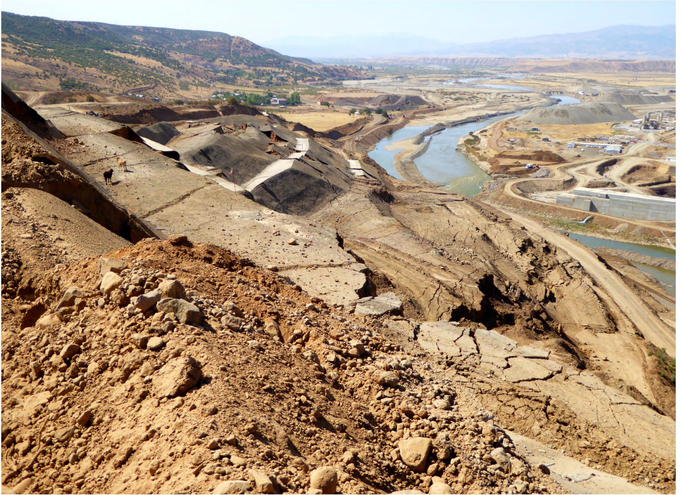
Landslide in Turkey