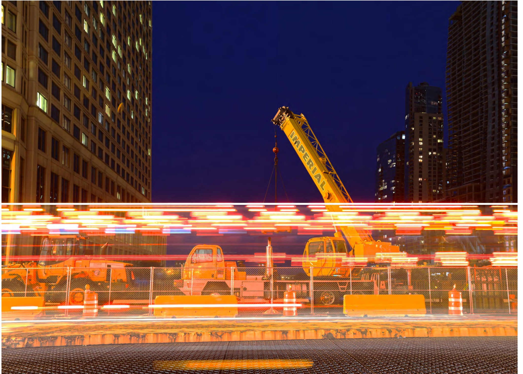
Construction of Michigan Avenue – by Brenda Myung, Swiss Re (2018)