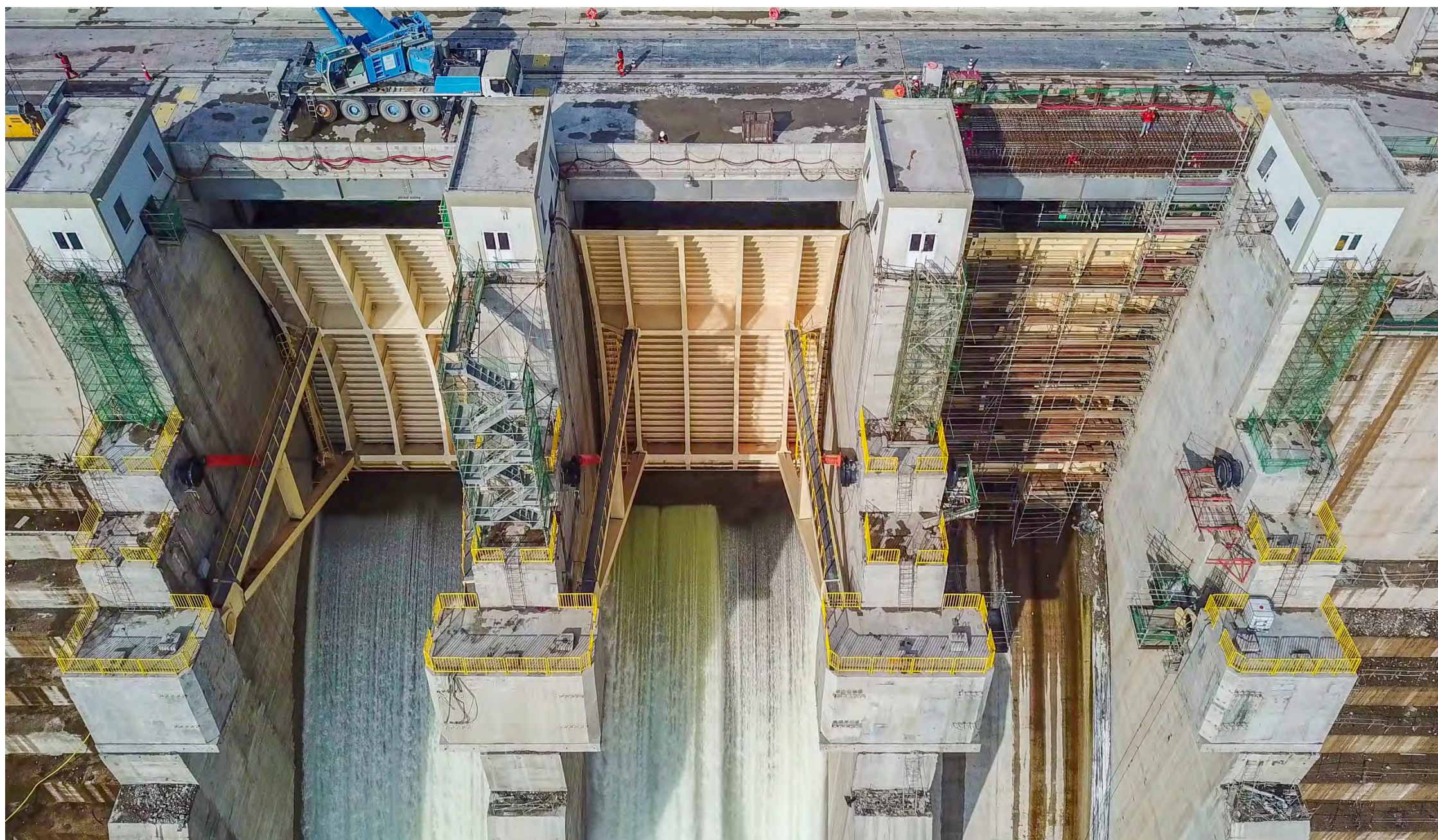
Hydro Power Plant Lauca